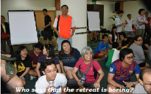
Who says that the retreat is boring?