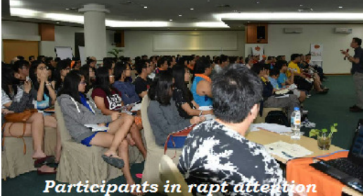
Participants in rapt attention

That tinge of humour kept people awake but that didn't take away the seriousness of what he had to deliver. Each message lasted for about close to 2h. I never imagined I could pay attention to a message for so long but I did (without even checking the time at all, as most would do to see when the message would end). I am sure almost everyone (young and old) did as well. With many members receiving fresh anointing during this retreat,